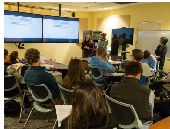
First year students present their research findings in the Collaboration Center in Davis Library's Research Hub.