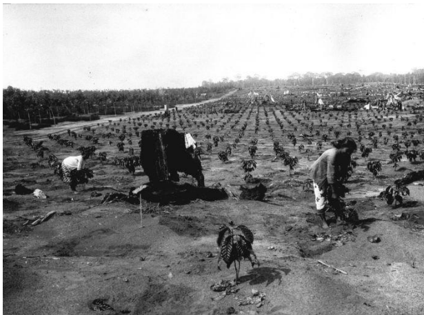
Coffee seedlings, East Sumatra

Such questions animate this introductory survey course in human geography. We examine places and the connections between them to build critical understandings of how social geographies figure in economics and politics, cultures and environments at local, regional, and global scales. Through a wide range of topics—from European imperialism to contemporary agriculture, from Indonesian coffee production to its consumption on UNC’s campus—we aim to make the foreign familiar and the familiar strange again.