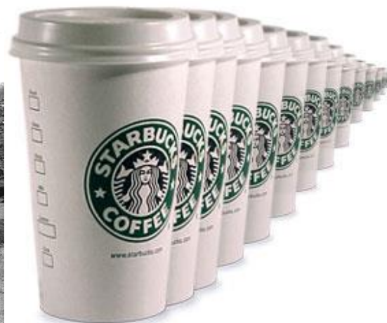
“Conquering New Grounds” (Brandchannel.com)